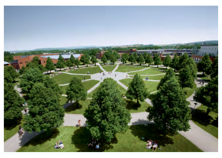
At the University of Bayreuth, you will find a wide range of opportunities for international exchange and focused research.