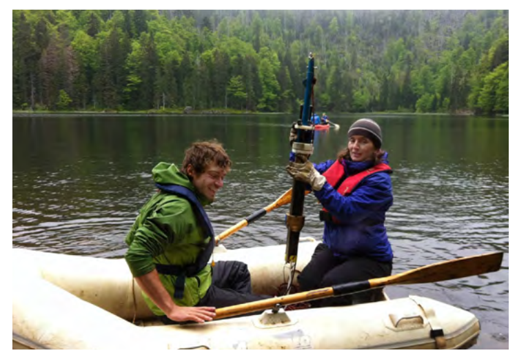
Environmental Chemists investigate air pollution, greenhouse gas emis sions, or contamination of soil, water, and plants.