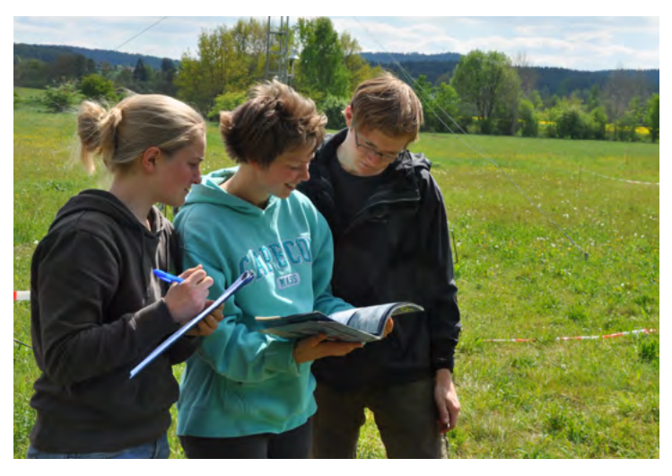
An individualized programme of study, a tight-knit community, and a low student-to-instructor ratio ensure an environment conducive to intellectual and personal growth.